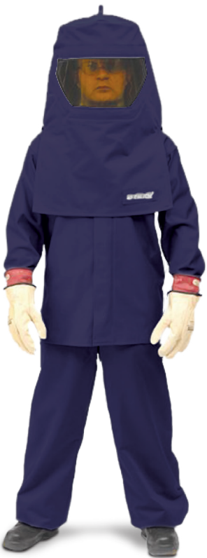
Arc Flash Suit