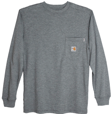
297 Carhartt Long Sleeve T-Shirt 6.7 oz, Heather Gray (31) ATPV 8.2, ARC 2