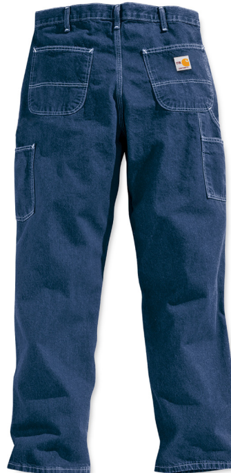
290 Carhartt Carpenter Jean 11.75 oz, 100% Cotton, Denim (83) ATPV 15.2, ARC 2 UL 2112 Certified