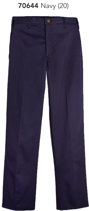
70644 Navy (20)

9.5 oz, Navy (20) ATPV 12.4, ARC 2, UL 2112 Certified