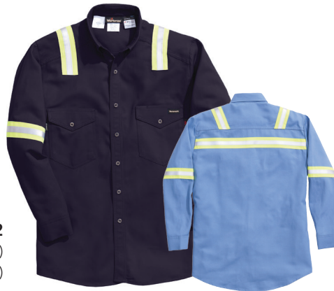
64302 88/12 Shirt with Reflective Trim 7 oz, Navy (20), Light Blue (80) ATPV 8.7, ARC 2, UL 2112 Certified