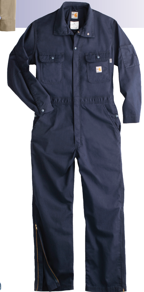
391 Carhartt 88/12 Coverall 7 oz, Navy (20) ATPV 8.6, ARC 2 ASTM 1506, UL 2112 Certified