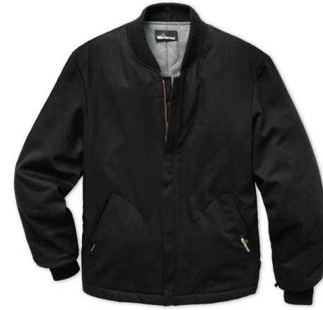
6728 UltraSoft® Liner/Jacket 10 oz, Black (35) ATPV 30.8, ARC 3 UL 2112 Certified