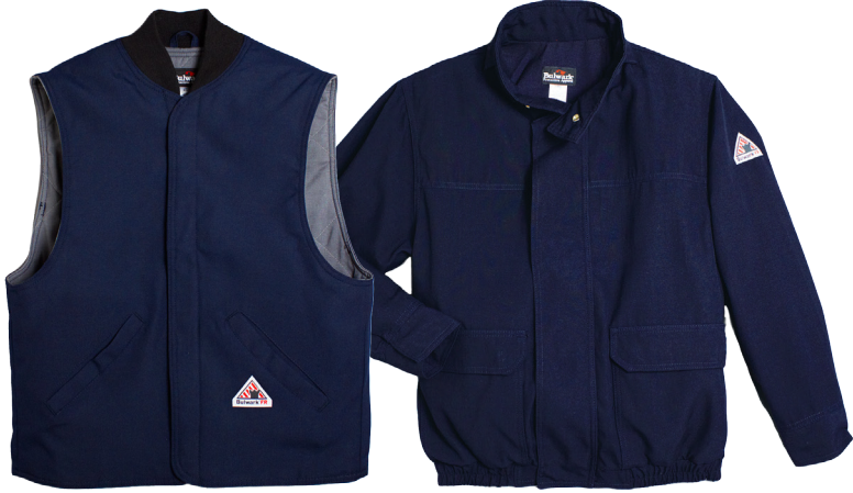
80309 Nomex® IIIA Vest/Jacket Liner Navy (20) ATPV 37, ARC 3 UL 2112 Certified (Can be worn with 80308)