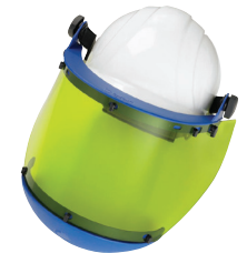
89512 Arc Flash Protective Face Shield

Additional PPE products available upon request.