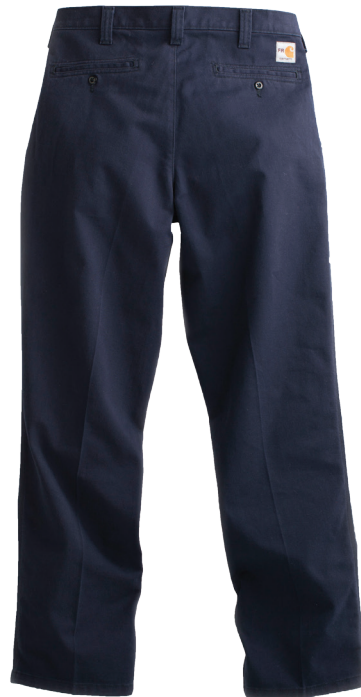
371 Carhartt 88/12 Pant 9 oz, Navy (20) ATPV 12, ARC 2 ASTM 1506, UL 2112 Certified