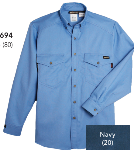
60694 Light Blue (80)