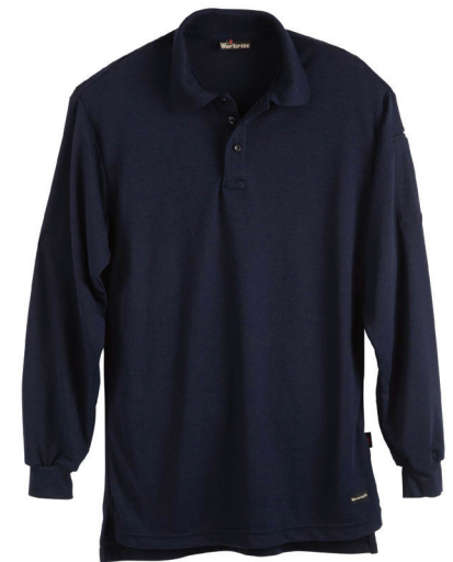
8066 Navy (20)

6.7 oz, Navy (20) ATPV 8.2, ARC 2, UL 2112 Certified