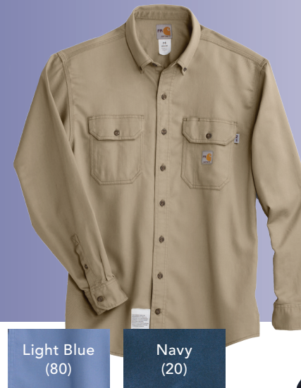
294 Carhartt 88/12 Long Sleeve Shirt 6.5 oz, Khaki (62), Light blue (80), Navy (20) ATPV 9.5, ARC 2 ASTM 1506, UL 2112 Certified