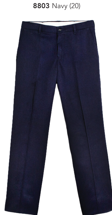
8803 Navy (20)