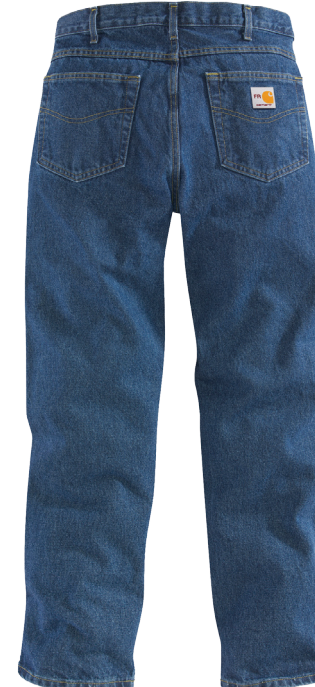
280 Carhartt Jean 14.75 oz, 100% Cotton, Denim (83) ATPV 23.8, ARC 2 UL 2112 Certified