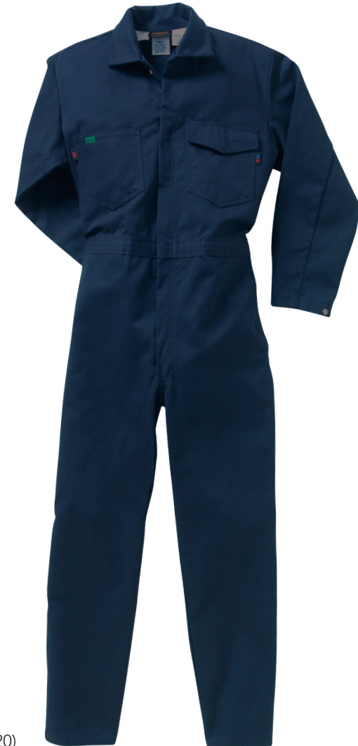
82302 UltraSoft® Coverall 9.5 oz, Navy (20) ATPV 12.4, ARC 2 UL 2112 Certified