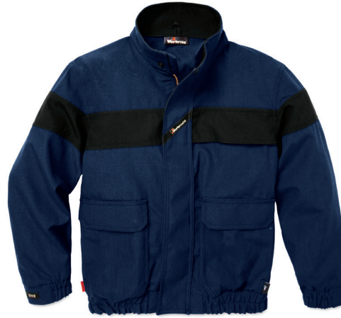
6724 UltraSoft® Bomber Jacket 10 oz, Navy (20) ATPV 12.4, ARC 2 UL 2112 Certified