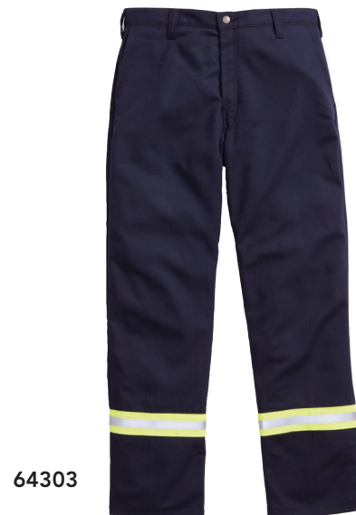
64303 88/12 Pant with Reflective Trim 9 oz, Navy (20) ATPV 12.4, ARC 2 UL 2112 Certified