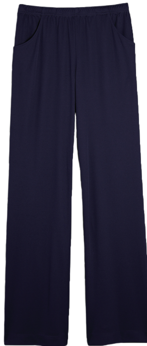
746 Nomex® IIIA Pants 7.5 oz, Navy (20) ATPV 7.0, ARC 1 UL 2112 Certified