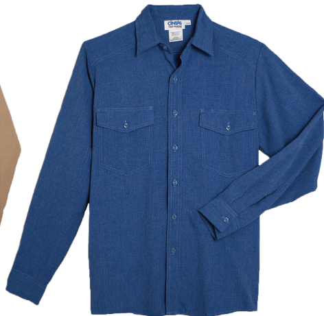
60698 Nomex®/Rayon Shirt 4.5 oz, Denim (83) ATPV 4.5, ARC 1 UL 2112 Certified