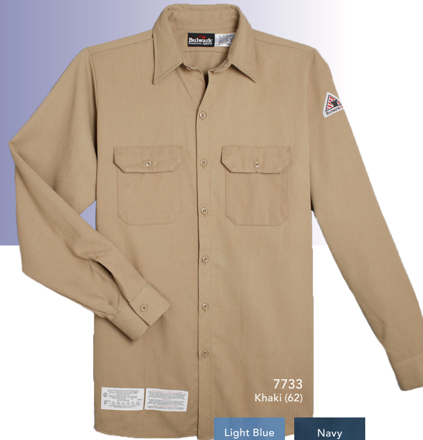
7733 Khaki (62)