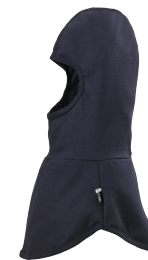
82337 Indura UltraSoft® Balaclava