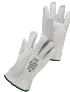
86938 Leather Glove Protectors 10" and 12"