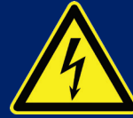
Electric Arc Flash