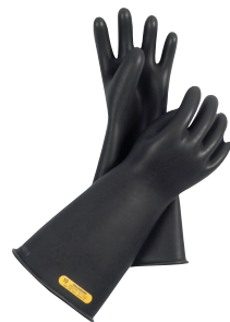
86935 Rubber Insulated Gloves Covers Classes 00, 0, 1, 2