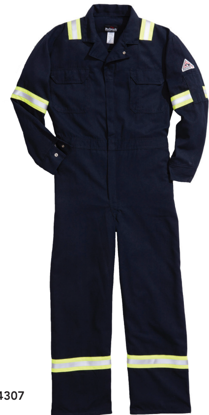
64307 Tecasafe™ Plus Coverall with Reflective Trim 7 oz, Navy (20) ATPV 10.1, ARC 2, UL 2112 Certified